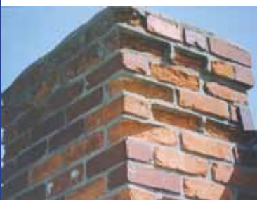
Severe spalling and deterioration is caused by water penetration.

Chimneys are highly exposed to the elements and, if left unprotected, are susceptible to structural deterioration. It is important to address this problem before serious damage occurs. A complete protection program should include a chimney cap and repair of any cracks or deterioration on the crown, mortar joints and flashing; in addition to an application of ChimneySaver Water Repellent to the entire chimney.