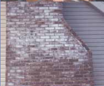
Efflorescence stains caused by water penetration and leaching salts are unsightly and add to deterioration.