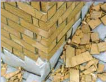
Water penetration and freeze/thaw damage result in loss of insulation value and lead to structural failure.